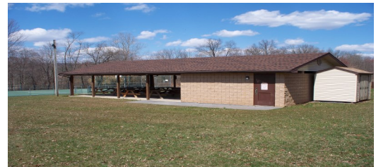
Chapel Gate Park Pavilion

Anyone may reserve a pavilion in any of the parks: Chapel Gate Park, Main Street Park, or the Schoeneck Park. The rental fee is $50.00 and is non-refundable. Please call the Township Office at 336-8720 to make your reservation.